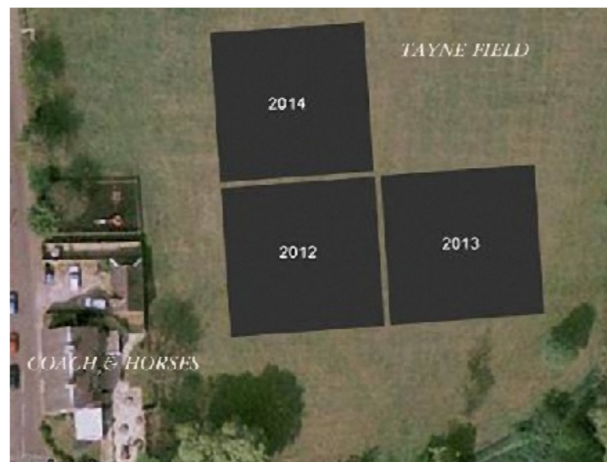
Proposed future dig sites on Tayne field